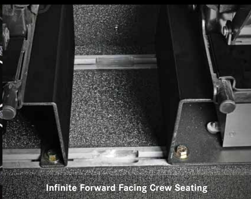
Infinite Forward Facing Crew Seating