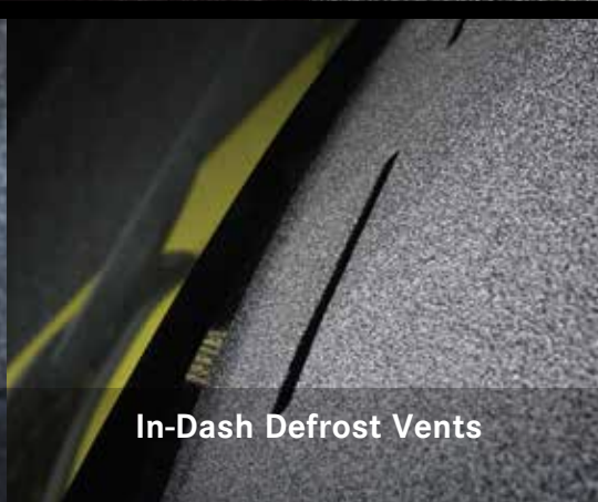
In-Dash Defrost Vents