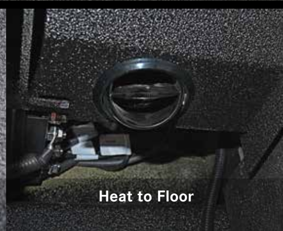
Heat to Floor