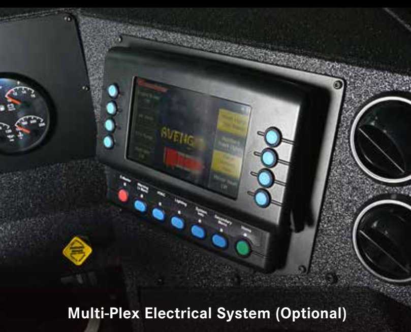
Multi-Plex Electrical System (Optional)