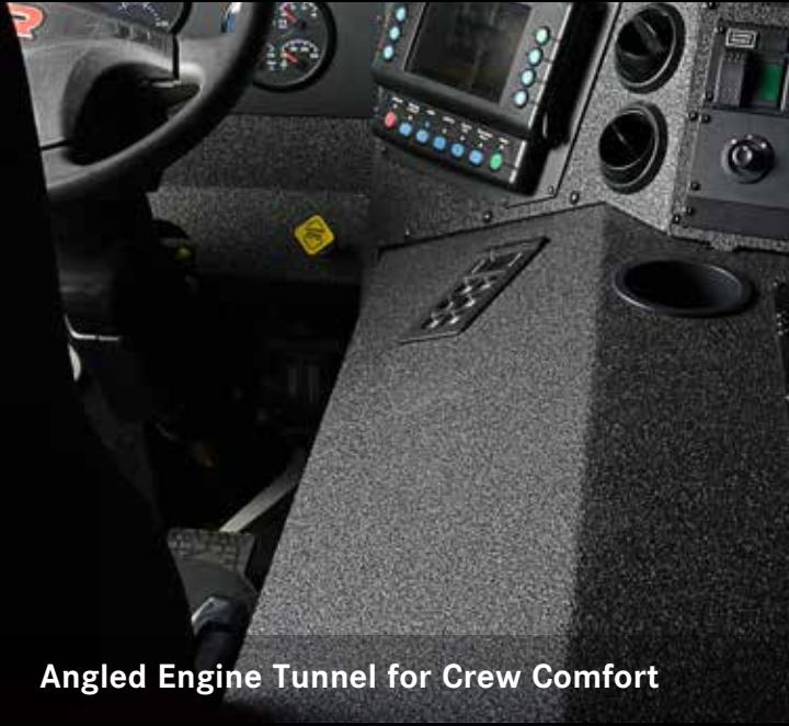
Angled Engine Tunnel for Crew Comfort