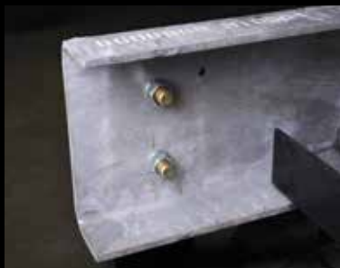
Hot Dip Galvanized Rail and Cross-Members Optional