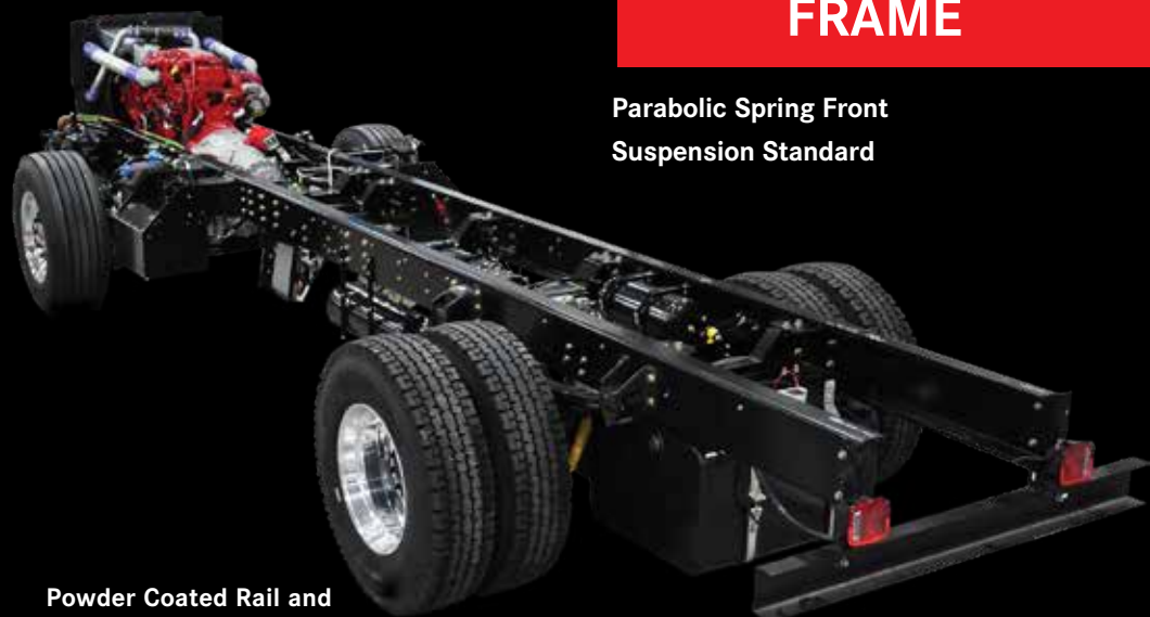
Powder Coated Rail and Cross-Members Standard