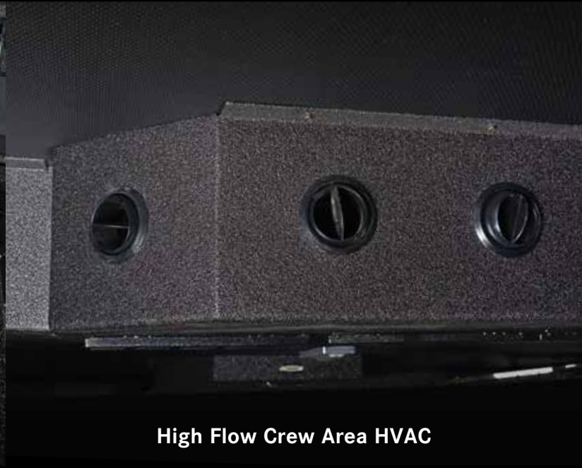
High Flow Crew Area HVAC